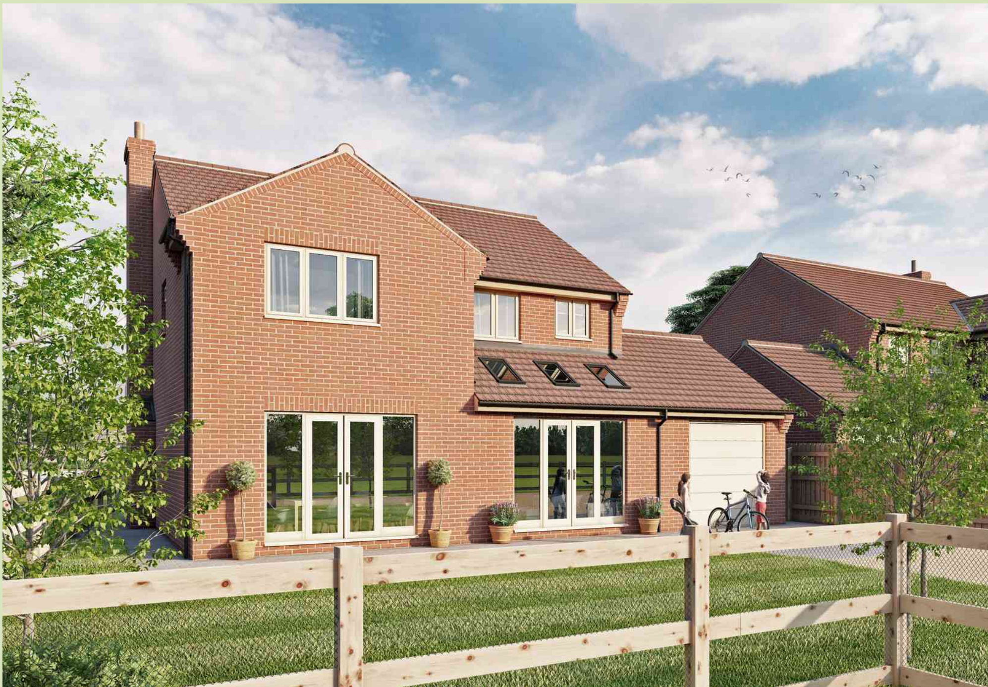
Fair View, West Winch Guide Price £440,000