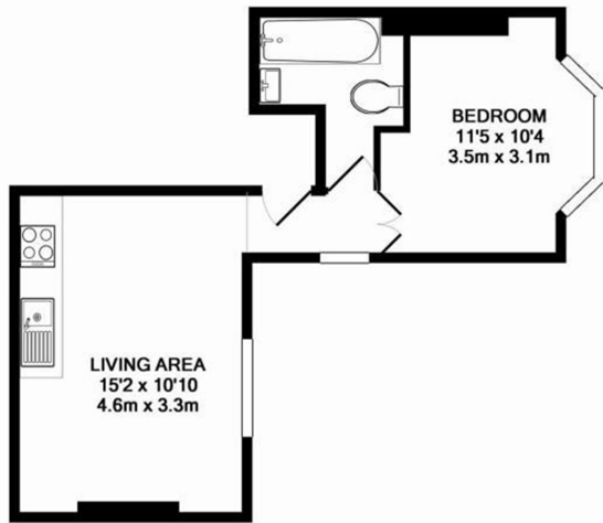
TOTAL APPROX. FLOOR AREA 29.4 SQ.M. (316 SQ.FT.) Made with Metropix ©2016

Tenure: Share of Freehold Length of lease: 900+ years Service charge - £600 pa Ground rent - peppercorn Council tax band - A Parking permit zone: A (no waiting list) No short term lets allowed Pets allowed with consent from freeholders