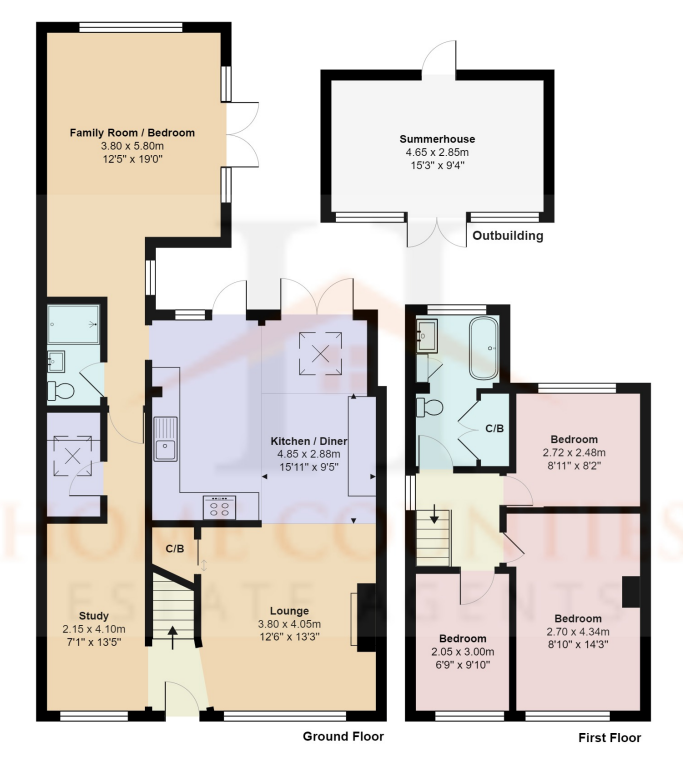
Dugdale Hill Lane, Hertfordshire EN6 Total Area: 134.1 m² ... 1444 ft² Inc Summerhouse All measurements are approximate and for display purposes only