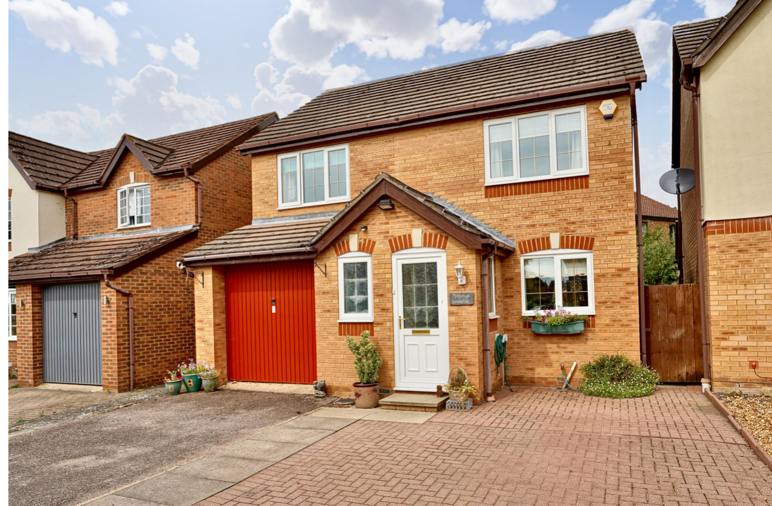
79a Sparrowhawk Way, Hartford PE29 1XE