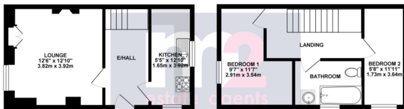
1ST FLOOR 306.96 sq. ft. (28.52 sq. m.)

TOTAL FLOOR AREA: 613.92 sq. ft. (57.03 sq. m.) approx.