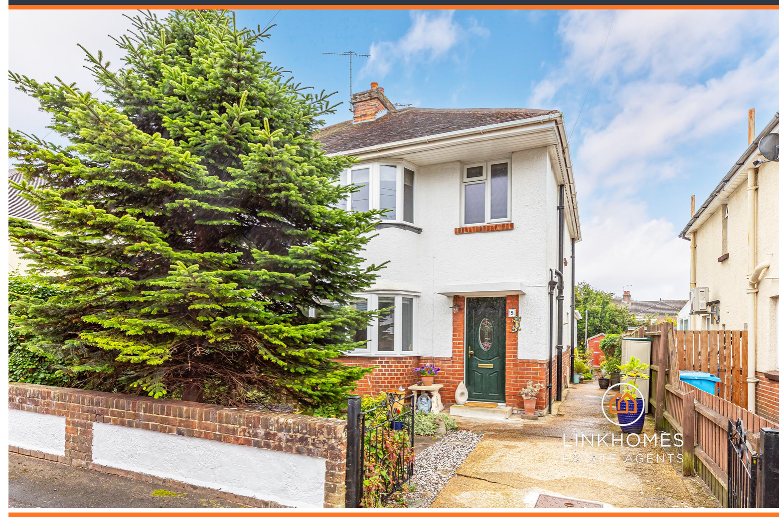
5 Winterbourne Close, Poole, Dorset, BH15 2ET Guide Price £380,000

** CHARMING CHARACTER HOME ** Link Homes Estate Agents are delighted to present for sale this three bedroom, two bathroom semi-detached house situated in the sought-after Oakdale location. Benefitting from an array of standout features including three good-sized bedrooms, a snug lounge with a working feature fireplace, a modern shaker style kitchen, a dining room with French doors leading onto the south facing private rear garden, an office/snug, two three-piece bathrooms suites and off-road parking for one vehicle. This property is a must view to avoid disappointment!