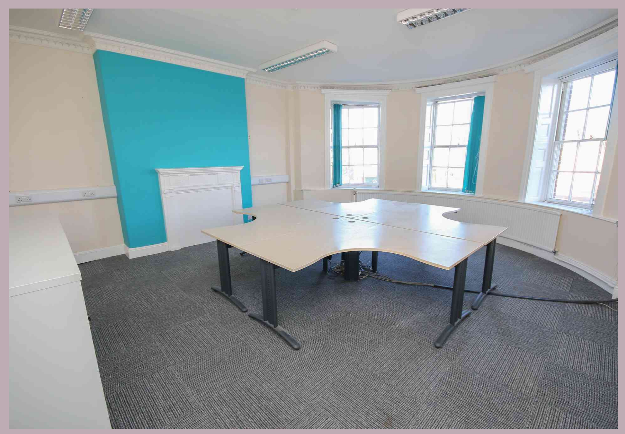
Bishops Lynn House (Hot Desks), King's Lynn from £50 per calendar month