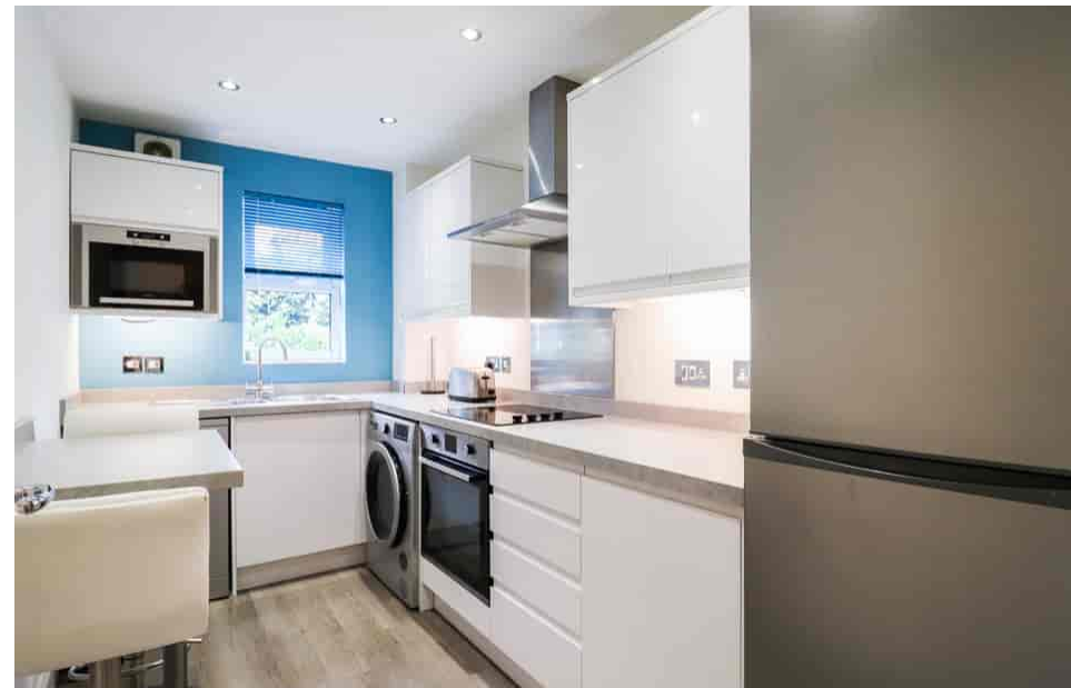
Bradgate House, Billing Road, Northampton NN1 5BH Offers Over £180,000 - Leasehold