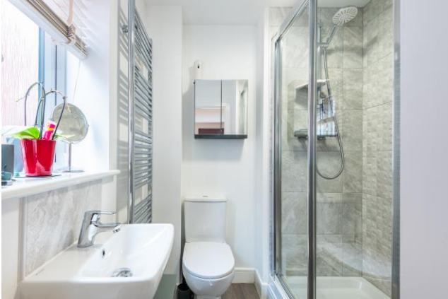
EN-SUITE SHOWER ROOM 1

EN-SUITE SHOWER ROOM (6'7 x 5'9) Three piece suite comprising walk-in shower, WC and wash hand basin. Tiled splashbacks, heated towel rail, wood effect laminate flooring and UPVC double glazed frosted window to the side.