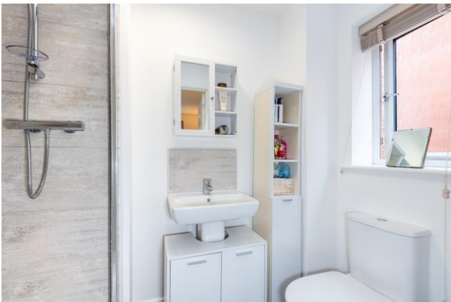
EN-SUITE SHOWER ROOM 2

EN-SUITE SHOWER ROOM 2 (7'4 x 4'6) Three piece suite comprising walk-in shower, WC and wash hand basin. Tiled splashbacks, heated towel rail, wood effect laminate flooring and UPVC double glazed frosted window to the side.