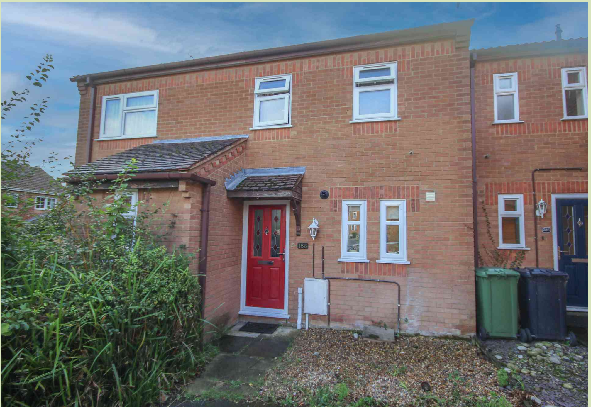
183 Elvington, King's Lynn Guide Price £179,950