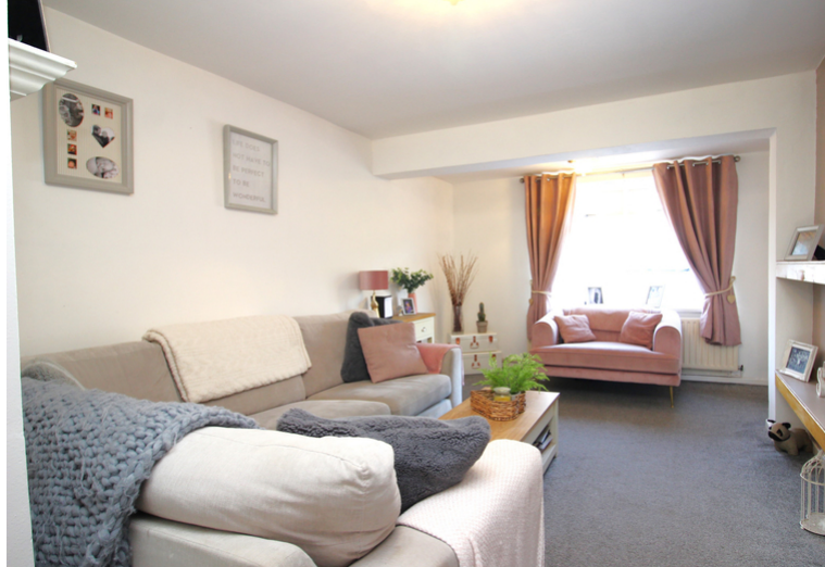
1 Pound Field, Llantwit Major, Vale Of Glamorgan, CF61 1DL

Tel No 01446 794433. E-Mail info@brightermoves.co.uk Web www.brightermoves.co.uk