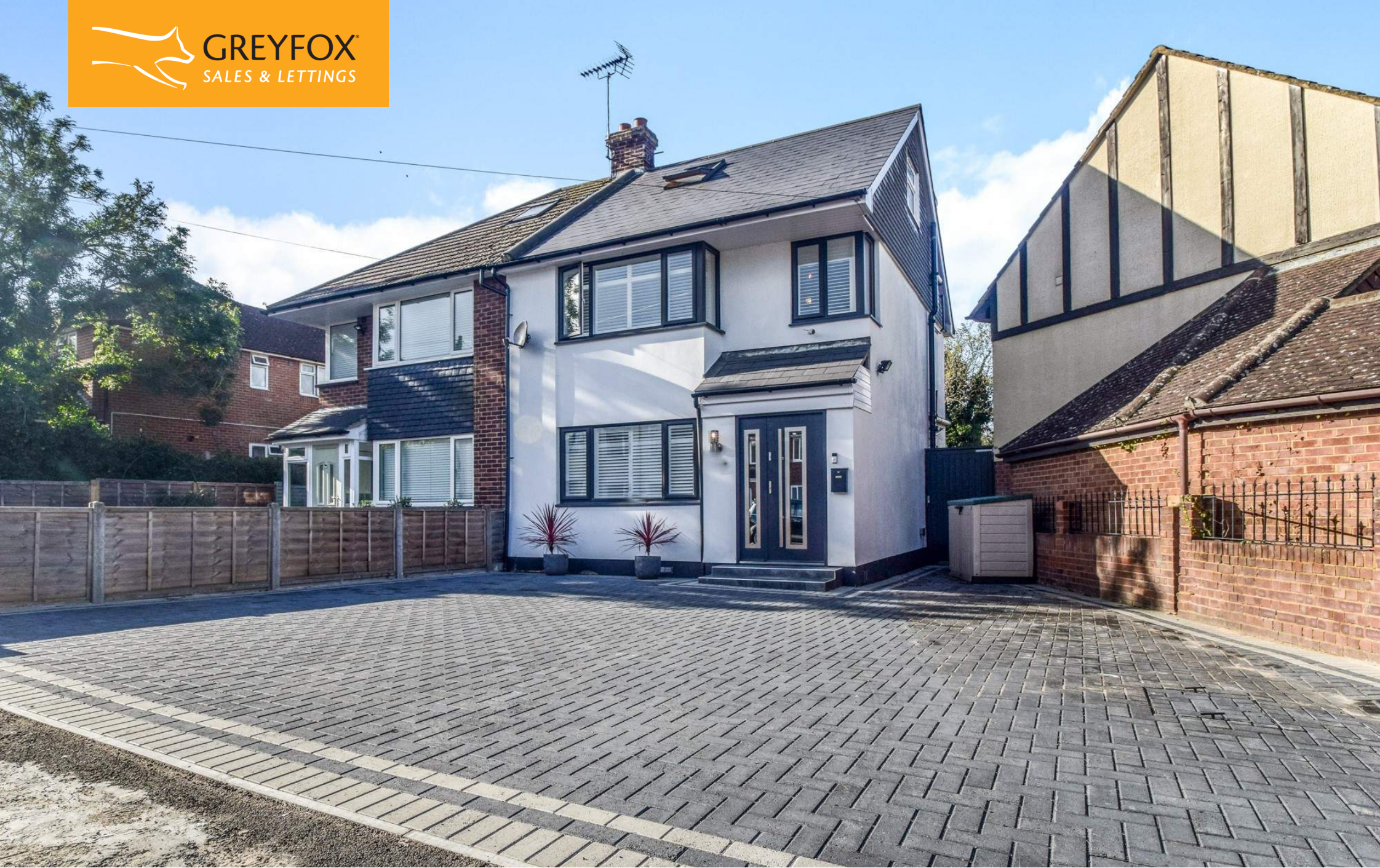
Four Bedroom Semi-Detached House Eastcourt Lane, Gillingham, Kent, ME7 2UW