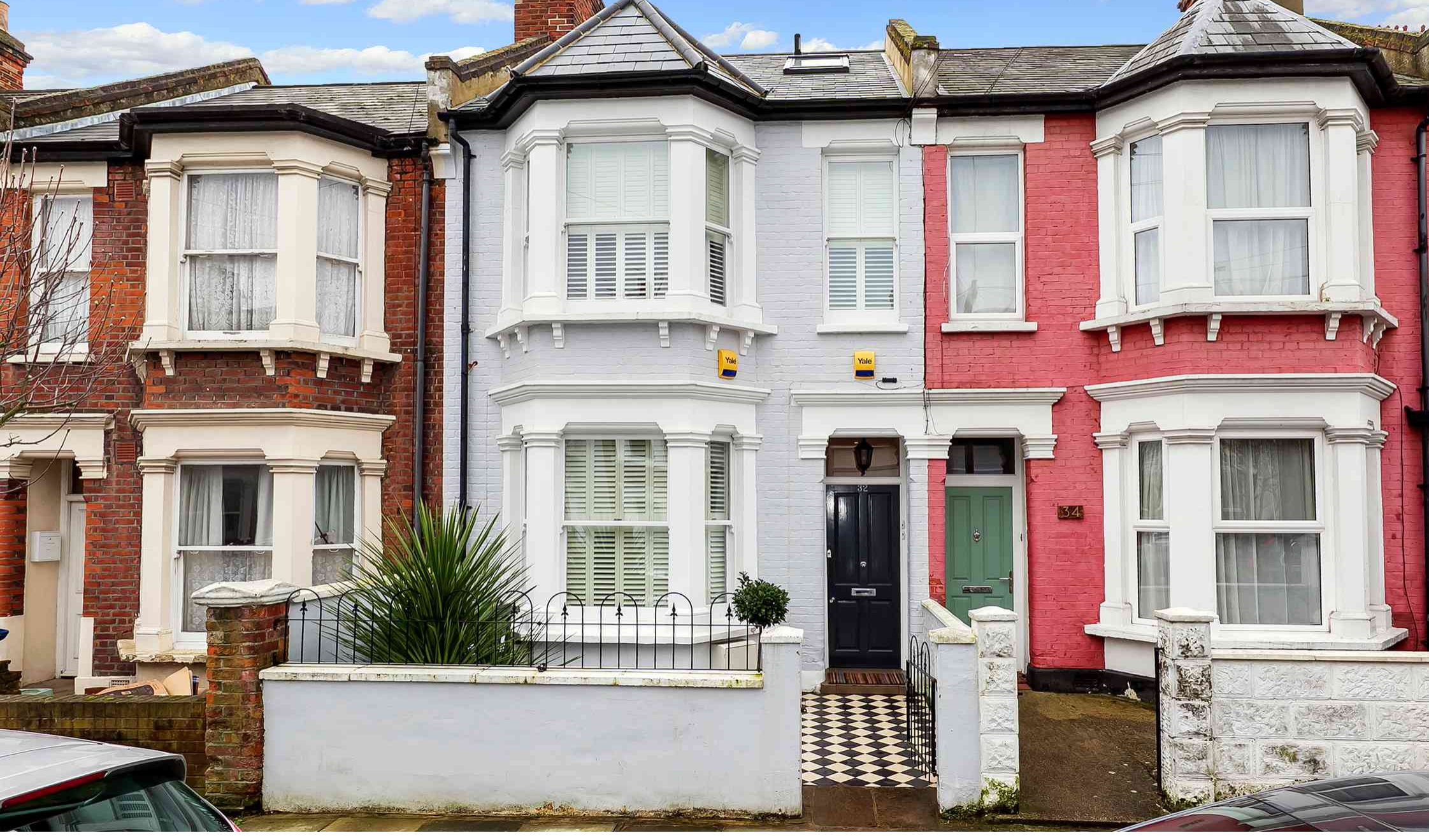
Leythe Road, London, W3 8AW