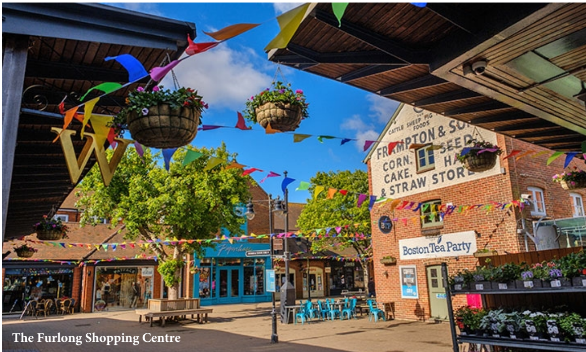
The Furlong Shopping Centre