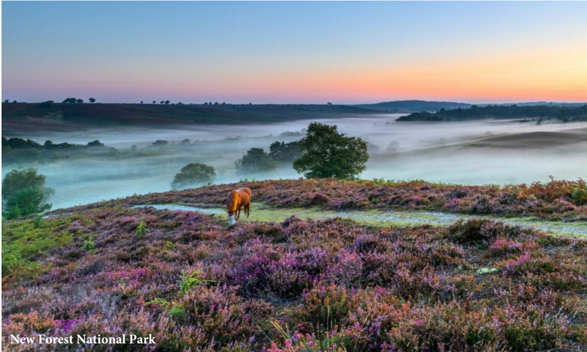
New Forest National Park