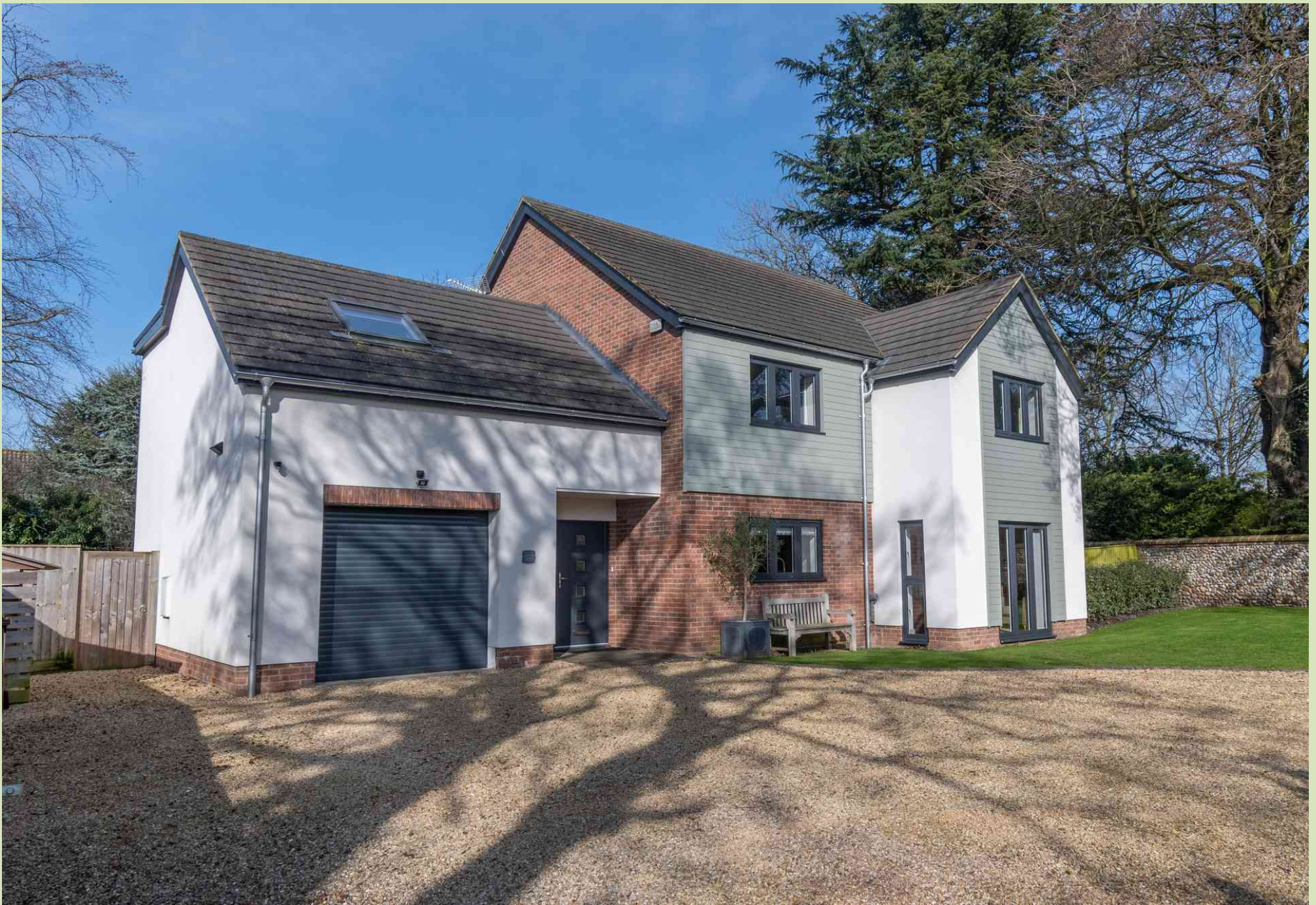
Oakwood House, Fakenham Guide Price £625,000