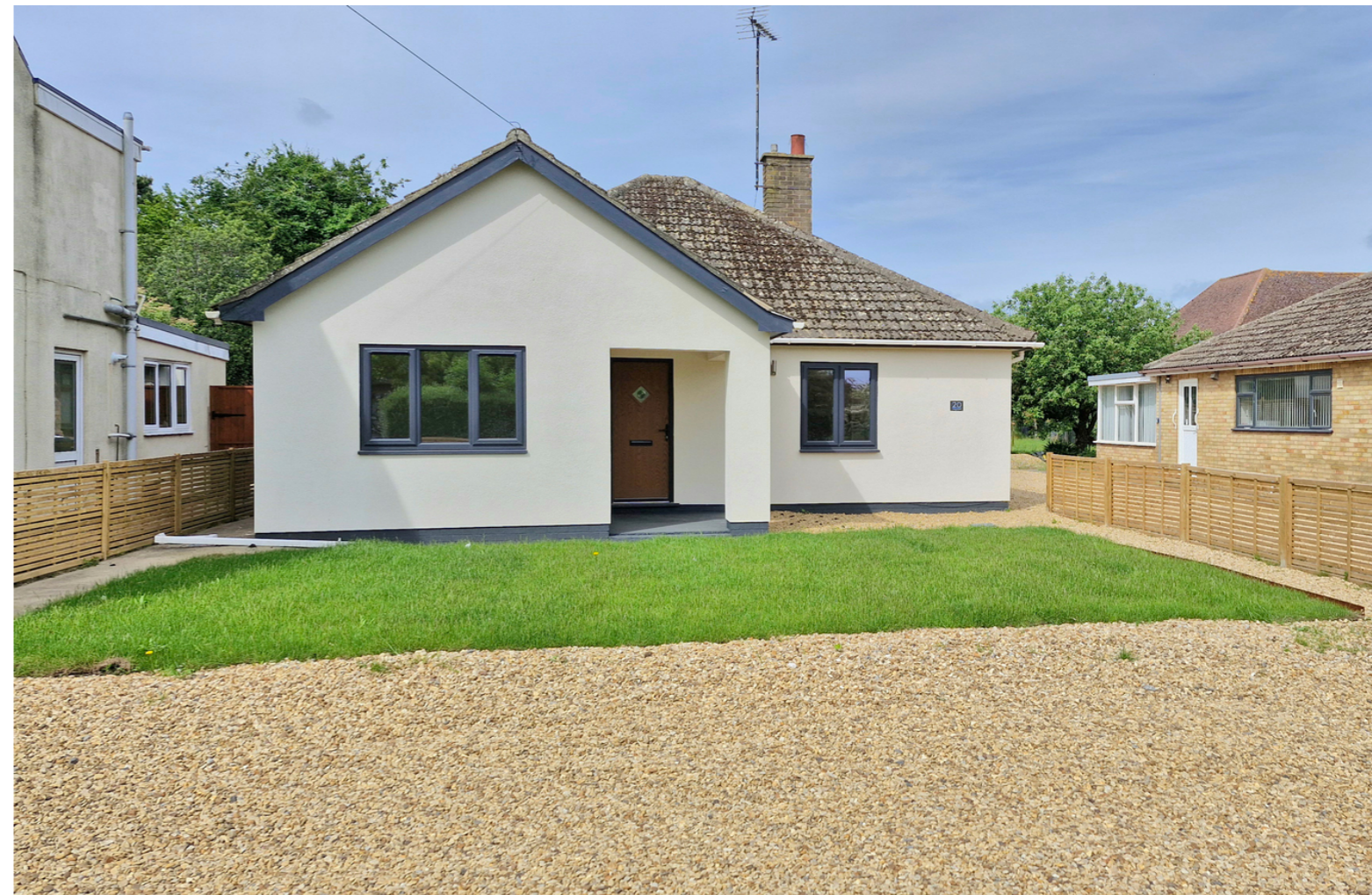
20 King Street, WEST DEEPING PE6 9HP