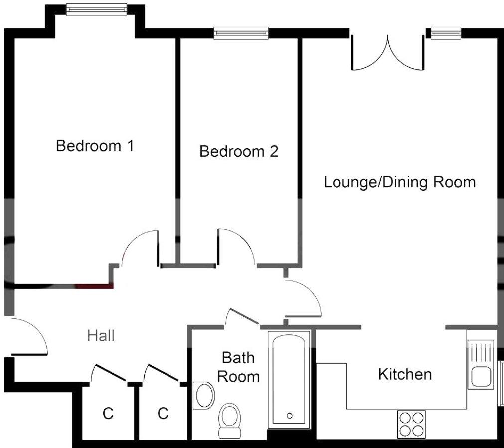
Second Floor Pound House, St James's Street, Portsmouth, PO1 3FF