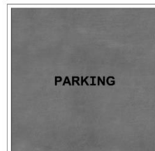
FIRST FLOOR FLAT

APPROX. GROSS INTERNAL FLOOR AREA 604.07 SQ. FT / 56.12 SQ. M