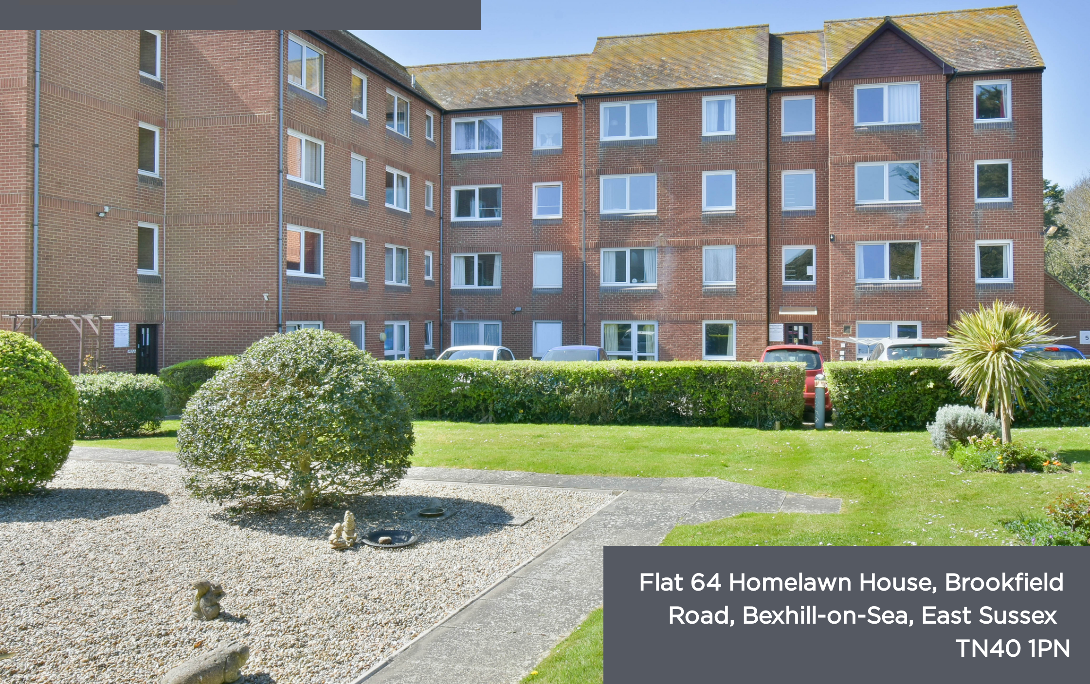
Flat 64 Homelawn House, Brookfield Road, Bexhill-on-Sea, East Sussex TN40 1PN