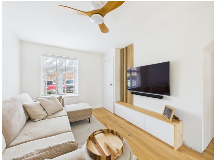
14' 8" x 12' 11" MAX (4.47m x 3.94m)