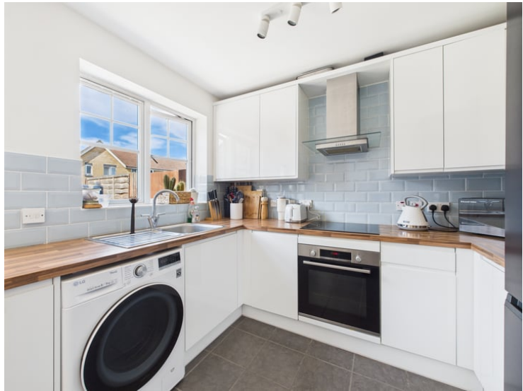
12' 10" x 9' 2" (3.91m x 2.79m)