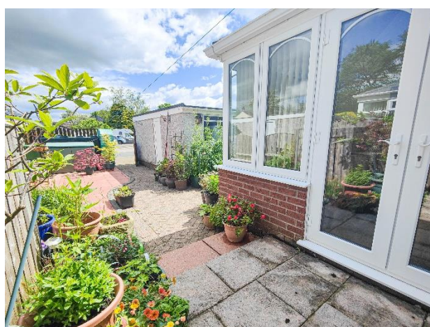
REAR GARDEN, PARKING & GARAGE

LOCATION – Located on the edge of the Lake District National Park about 5 miles west of Penrith, Greystoke has a general store with post office and off licence, a primary school and well known pub the Boot & Shoe – all within walking distance. Further amenities are available in Penrith where there is a good range of primary and secondary schools, shops, restaurants and further leisure facilities.