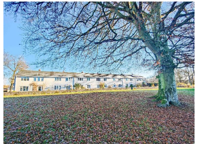
VIEW FROM ACROSS THE GREEN