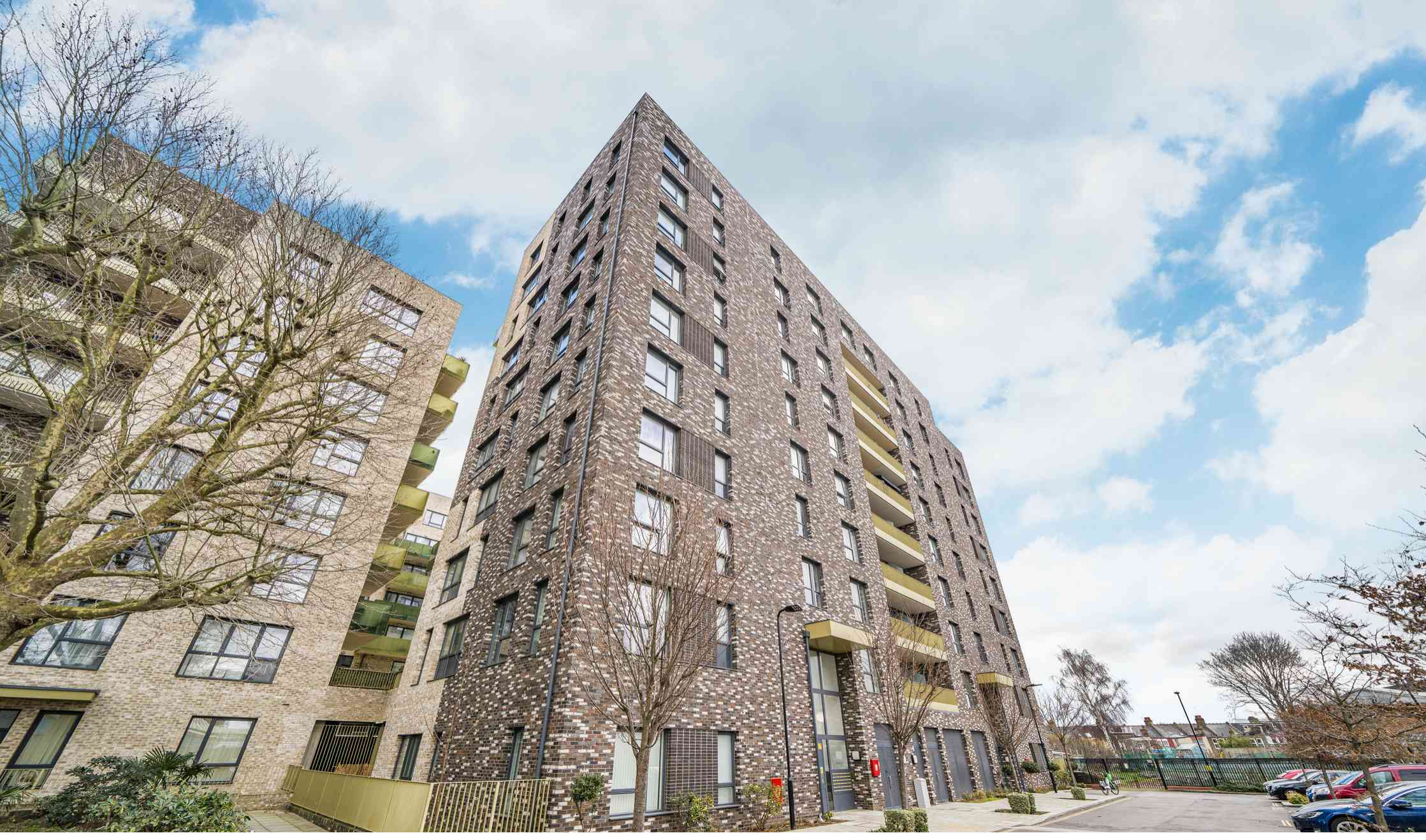
Stanley Road, London, W3 8GQ