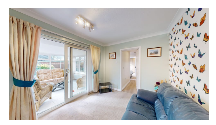
Master Bedroom With En Suite and Dressing Room