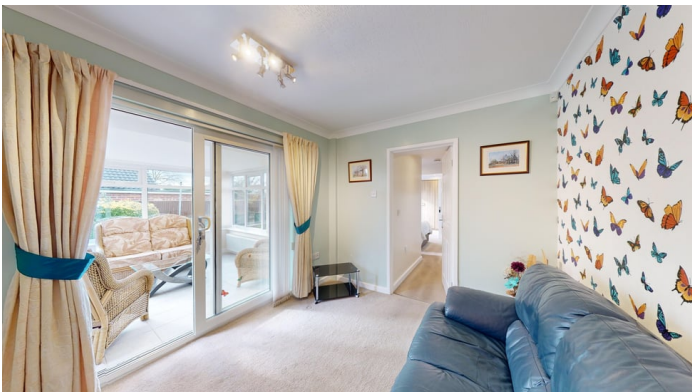
Master Bedroom With En Suite and Dressing Room