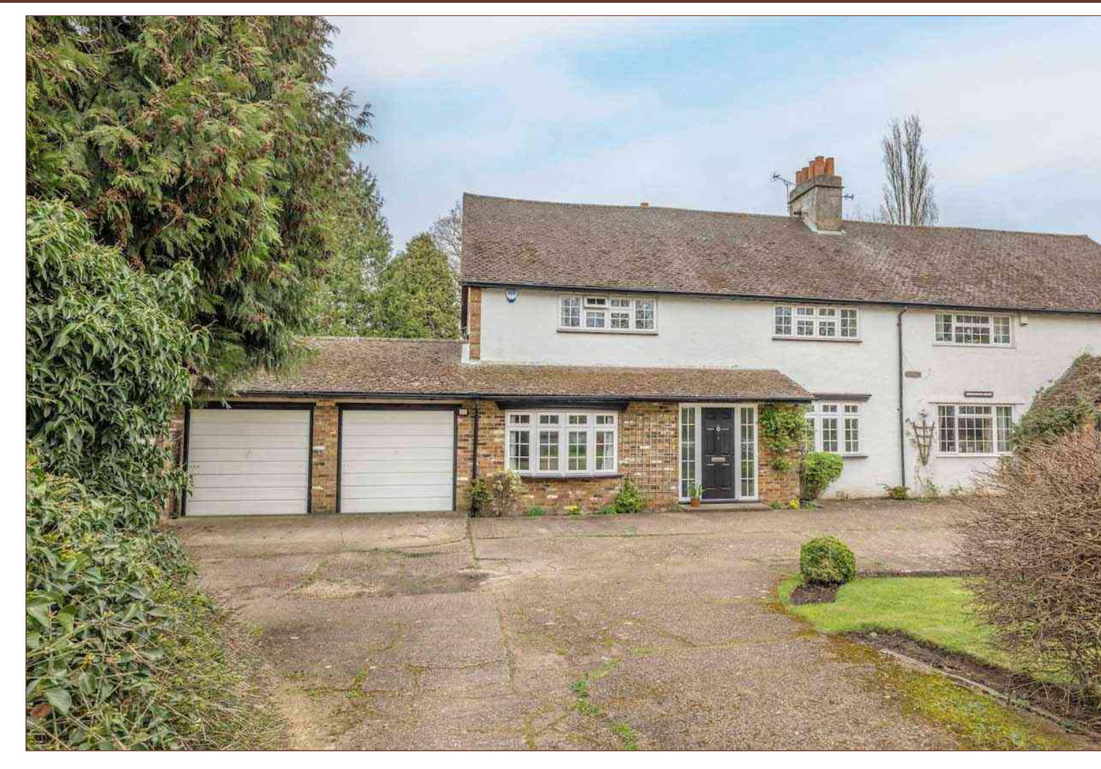
This four bedroom semi-detached family home is situated on a substantial corner plot backing onto open countryside and is offered to the market with ample potential for further extensions and redevelopment (STP). The property is set on a 1/3 acre plot (approx.) and was built in 1900.

The ground floor features three reception rooms with the inclusion of a 15ft bay fronted living room, a 16ft dining room and a 10ft family room. There is also a 16ft fitted kitchen, an adjoining utility room and a downstairs cloakroom.