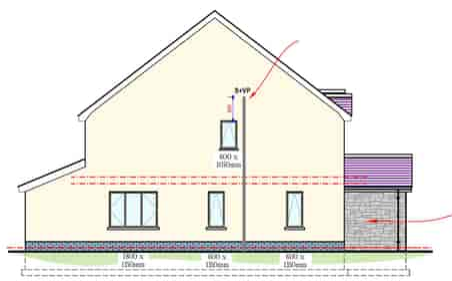
Left Side Elevation 1:100