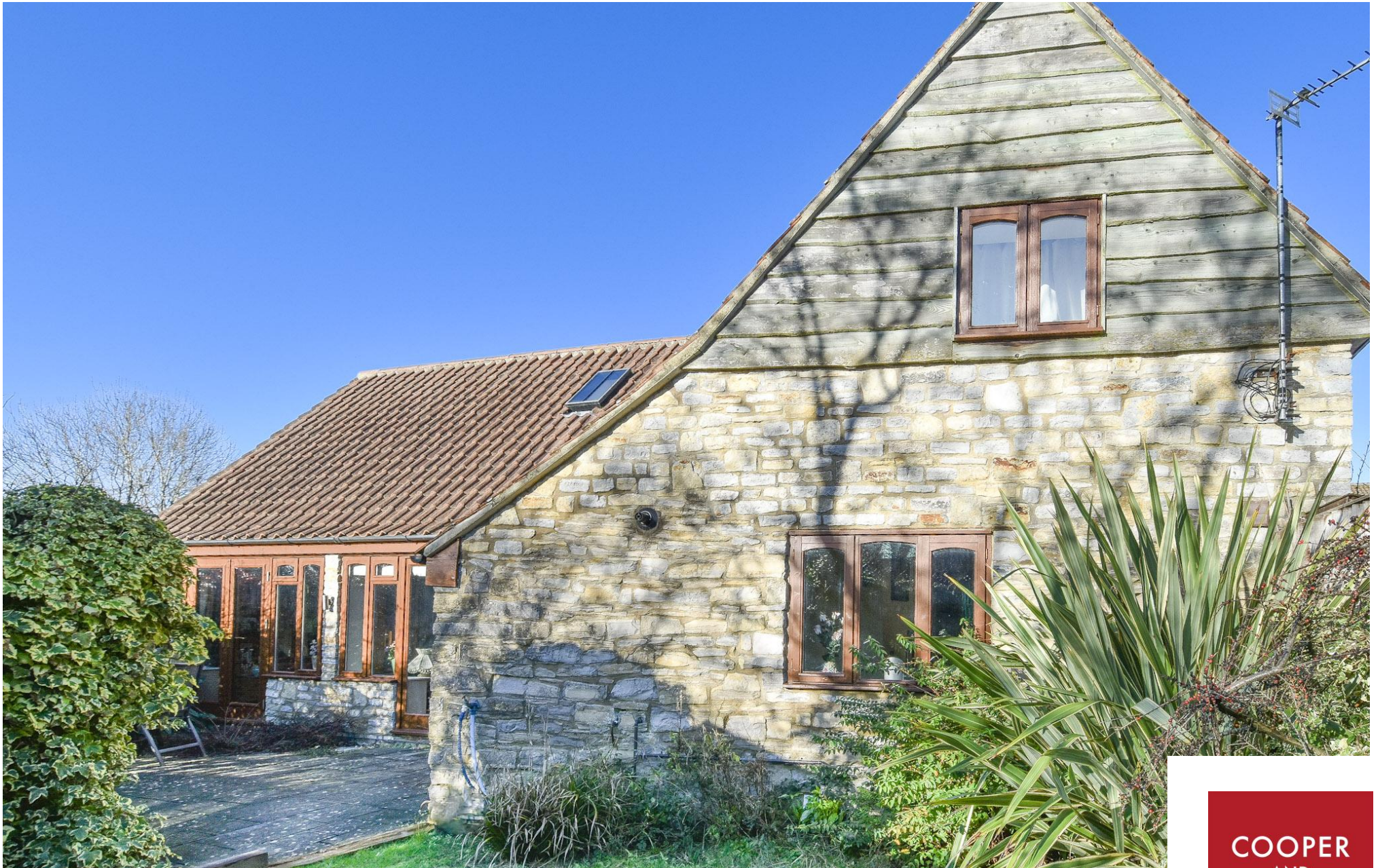
May Blossom Barn, Back Lane, Chapel Allerton, BS26 2PG