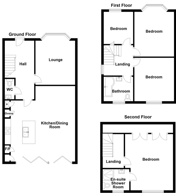
Total area: approx. 137.5 sq. metres (1479.6 sq. feet)