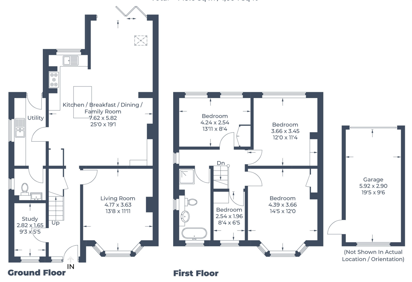
Illustration for identification purposes only, measurements are approximate, not to scale. © CJ Property Marketing Produced for Country Properties