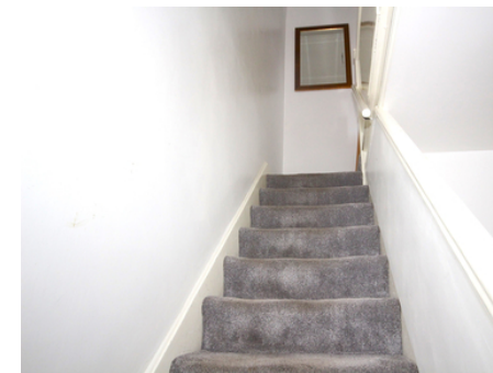
10 Mullway, Letchworth Garden City, Hertfordshire, SG6 4BH