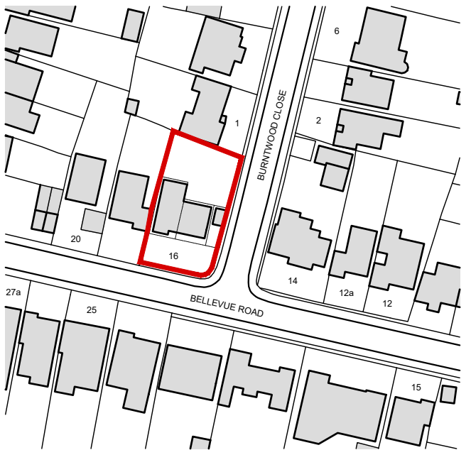
Site Location Plan @ 1:1250

THIS DRAWING IS COPYRIGHT AND MUST NOT BE REISSUED, LOANED OR COPIED WITHOUT THE WRITTEN CONSENT. ALL DIMENSIONS MUST BE CHECKED ON SITE BEFORE PROCEEDING AND ANY DISCREPANCIES NOTIFIED IMMEDIATELY. ALL DRAWINGS TO BE READ IN CONJUNCTION WITH CONSULTANT STRUCTURAL ENGINEERS, MECHANICAL & ELECTRICAL CONSULTANTS, ACOUSTIC ENGINEERS, ENERGY CONSULTANTS, ETC. DESIGN CAL. SHEETS, SPECIFICATIONS AND DRAWINGS PLUS ANY ACCOMPANYING PRODUCT LITERATURE, ACCREDITED DETAILS, ETC. 0 10 A1 SHEET SHEET SIZE CHECK. WHEN PRINTED TO THE CORRECT SIZE THIS LINE SHOULD BE 10cm LONG (A1 SIZE DRAWING)