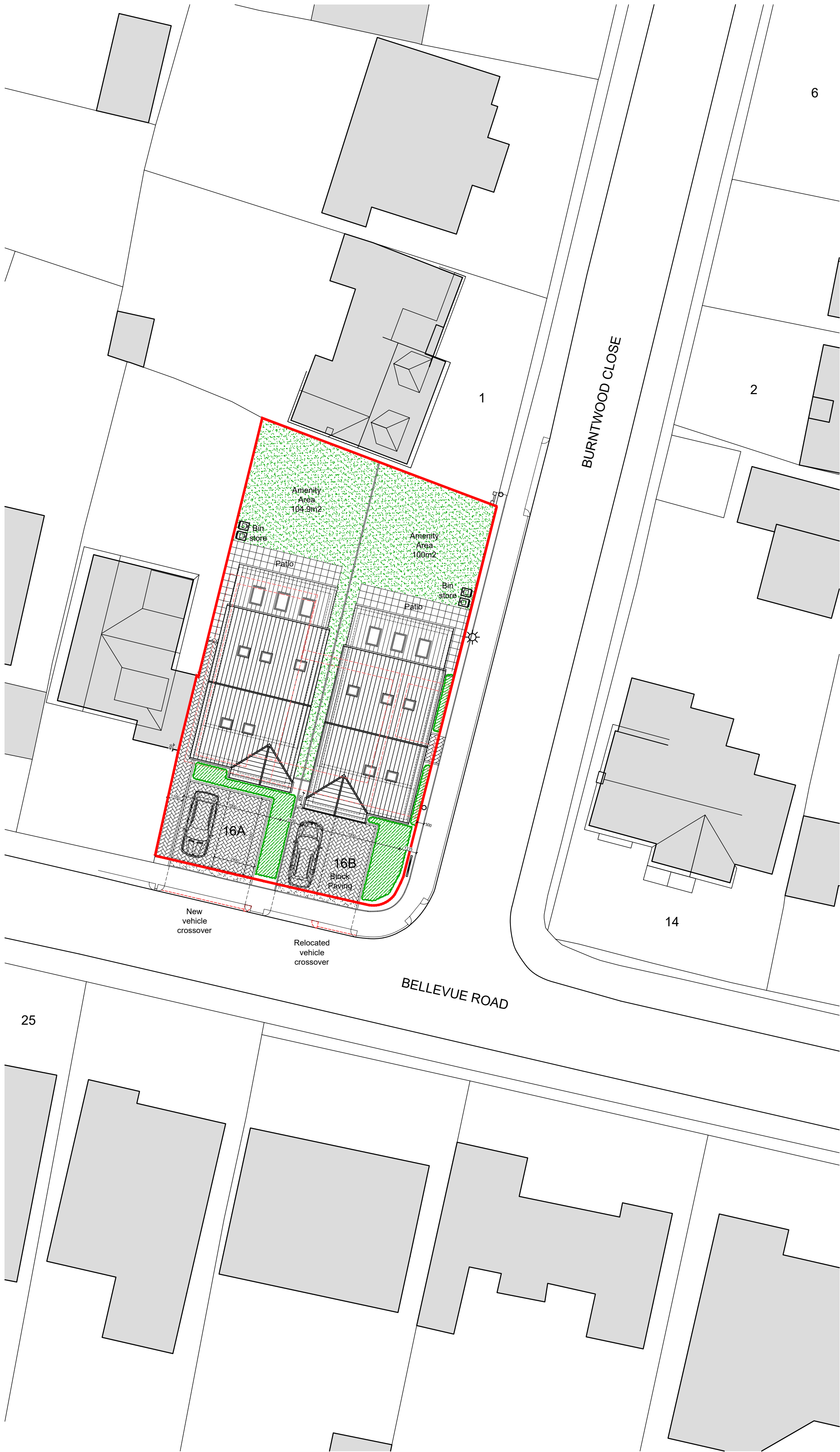
Proposed Block Plan @ 1:200