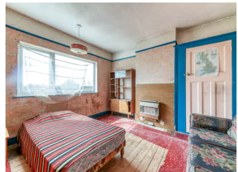
Carshalton Road, Mitcham, Surrey, CR4