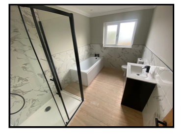
Plot 3, Barn Hill Lane, New Inn, Pencader, Carmarthenshire. SA39 9AW.