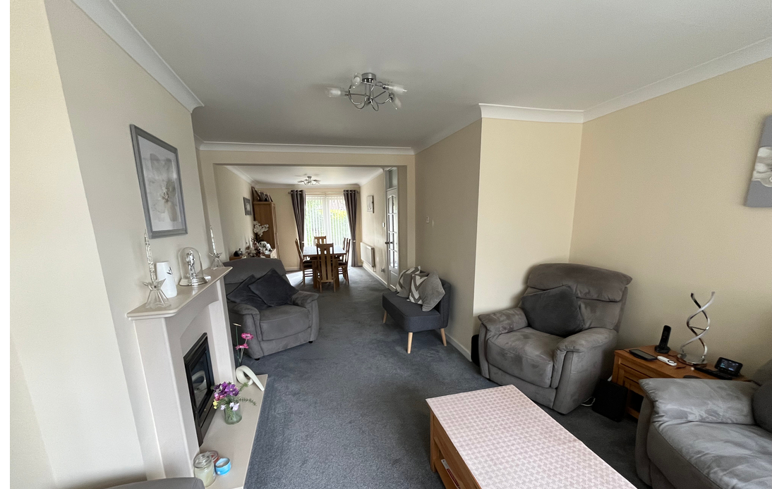
12 Caroline Court, Denman Drive, Ashford, Surrey TW15 2AW £605,000 - Freehold