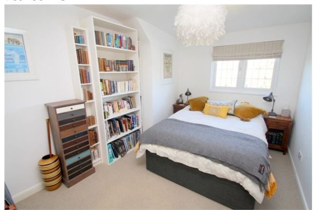
Rear aspect UPVC double glazed window, light and power points, single radiator.