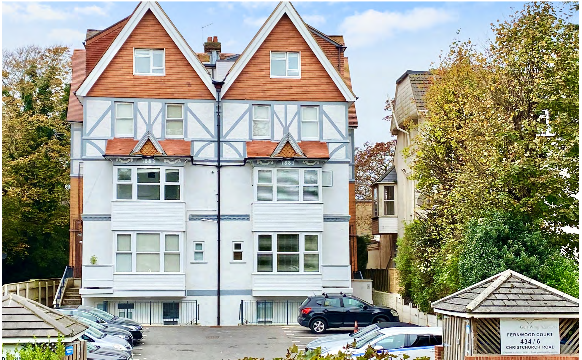
Fernwood Court, 434-436 Christchurch Road, Bournemouth BH1 4AY