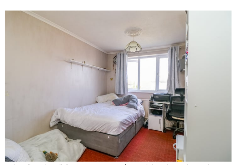
12'\ 10''\ x\ 8'\ 06''\ (3.91\ m\ x\ 2.59\ m) Double glazed window to front, radiator.