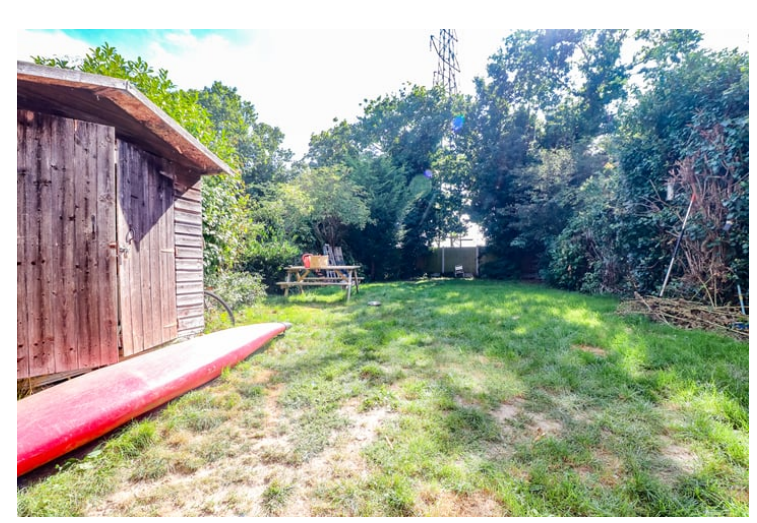
A private enclosed rear garden backing onto fields, retained by fencing, mainly laid to lawn, patio area, garden shed.