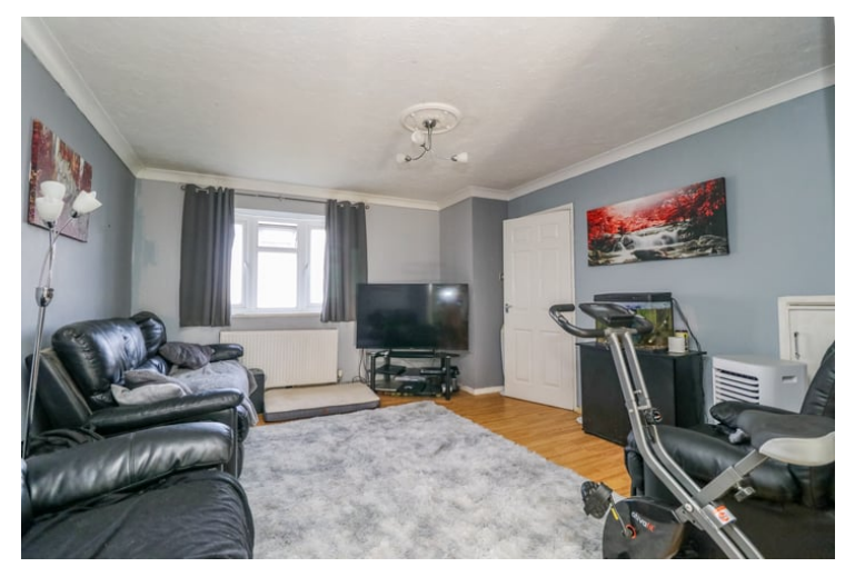
13' 09" \times 12' 10" (4.19m \times 3.91m) Double glazed window to front, patio door to rear, radiator.