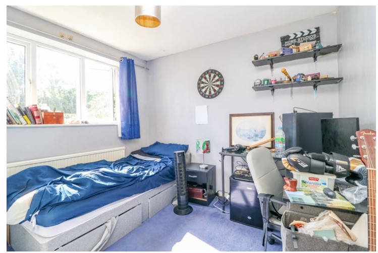
9^{\prime} 07" x 9^{\prime} 05" (2.92m x 2.87m) Double glazed window to rear, radiator.