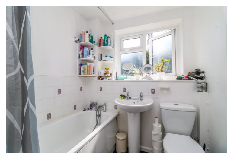
6' 03" x 5' 5" (1.91m x 1.65m) Double glazed obscure window to rear, radiator, panelled bath, low level WC and wash hand basin.