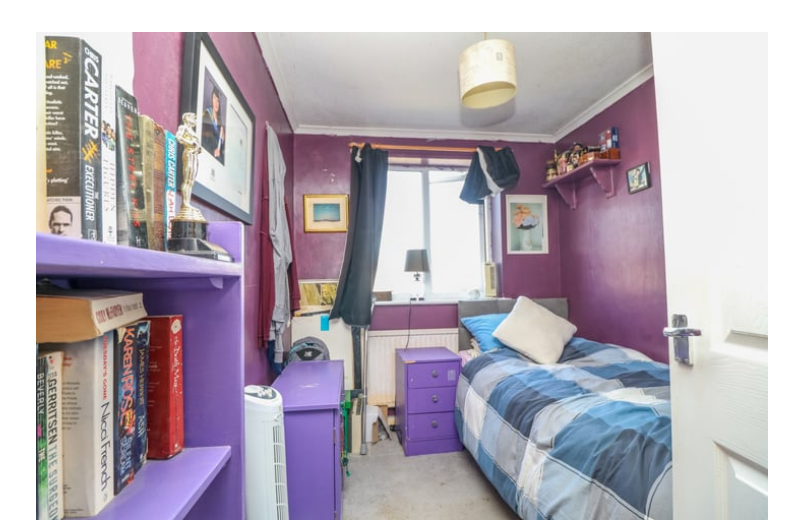
8^{\prime} 11" x 7^{\prime} 02" (2.72m x 2.18m) Double glazed window to front, radiator.