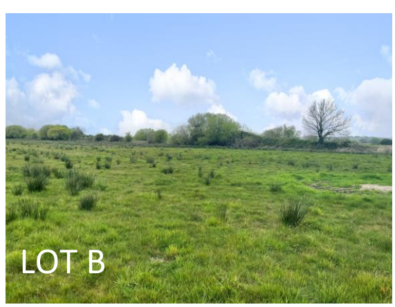
Auction Guide Price: OFFERED FOR SALE IN TWO LOTS*

Tuesday 18<sup>th</sup> June 2024, 12 midday The Theatre, The Royal Bath and West Showground, Shepton Mallet, BA4 6QN Bid remotely via Livestream, in person or by proxy.