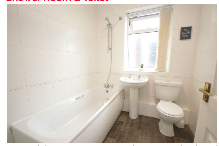
Comprising a separate shower unit, hand basin, toilet, vinyl flooring, mirror, window and towel rail.