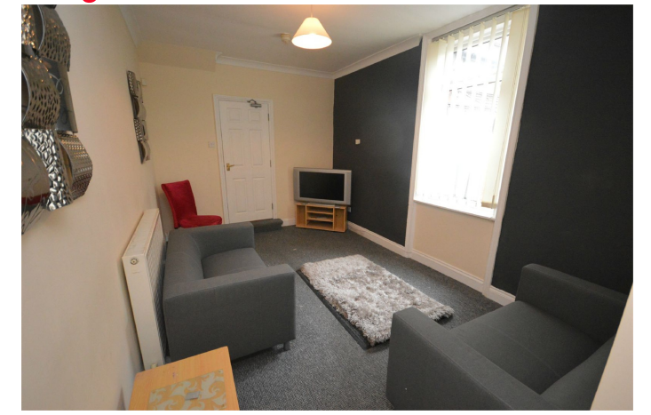
14' 9" x 9' 10" (4.50m x 3.00m) approx

Room is furnished with two large sofas, coffee table, TV stand and footrest. Leading to: