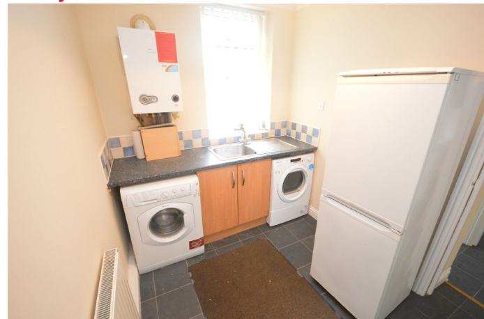
9' 7" x 6' 11" (2.93m x 2.10m) approx

Fitted with base units and laminate work surfaces over incorporating a stainless steel drainage sink with chrome mono bloc tap fitting, also including washing machine, separate tumble, dryer larder fridge freezer, vinyl flooring and door leading into: