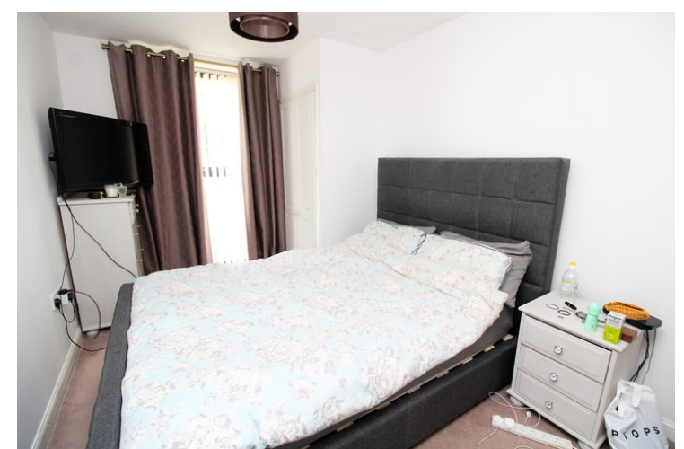
13' 7" x 8' 6" (4.14m x 2.59m) Floor to celling window to side aspect, built in double wardrobe, radiator, door to en suite.