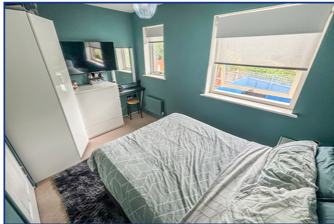
Tay Road, Tilehurst, Reading, Berkshire.