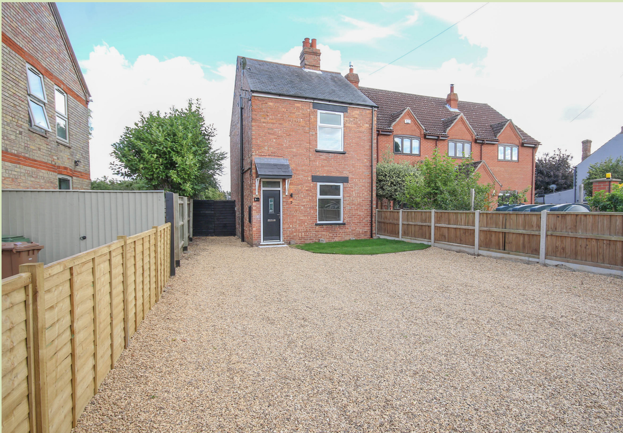
3 St Peters Road, Wiggshall St Germans Guide Price £250,000