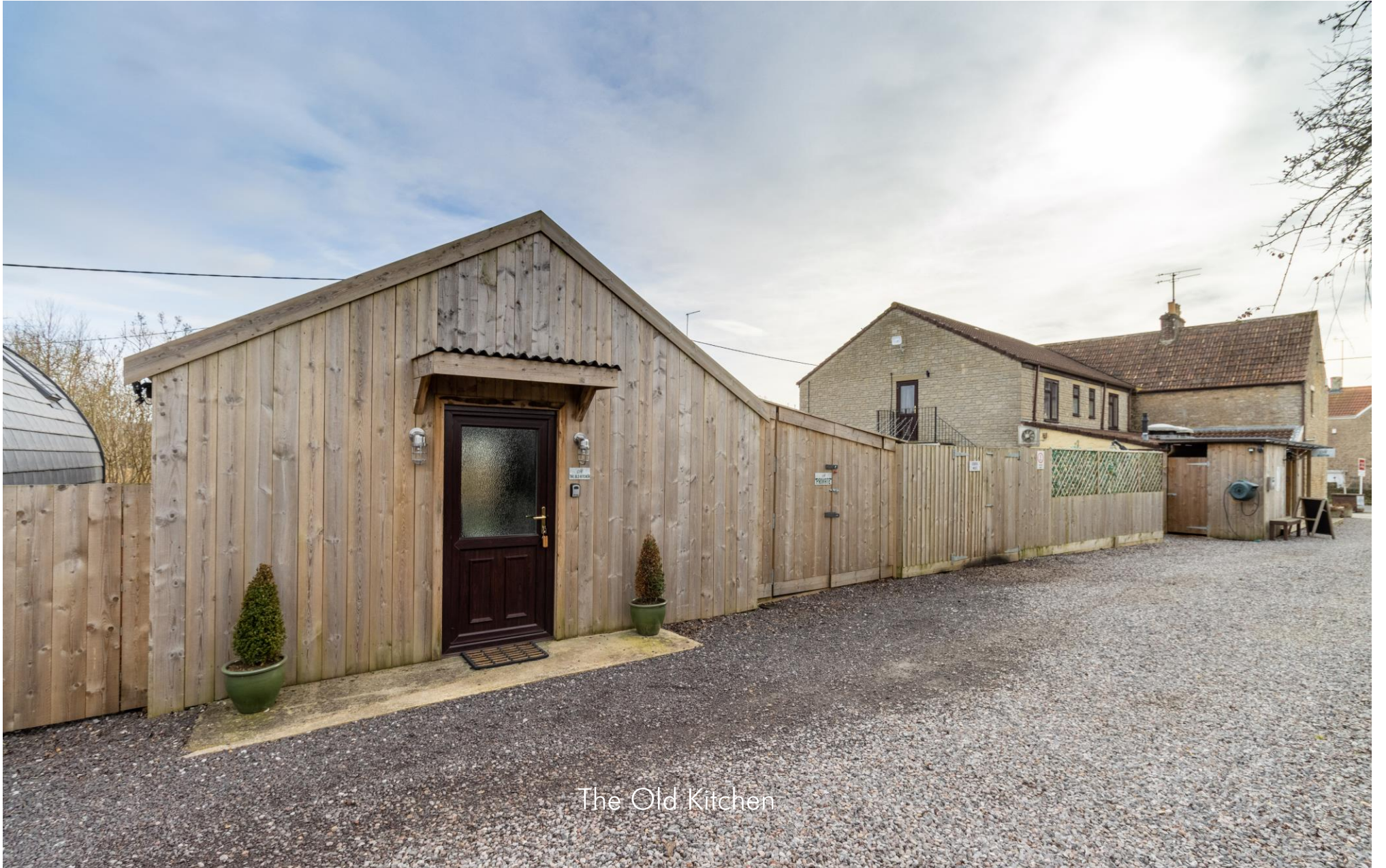
The Old Kitchen