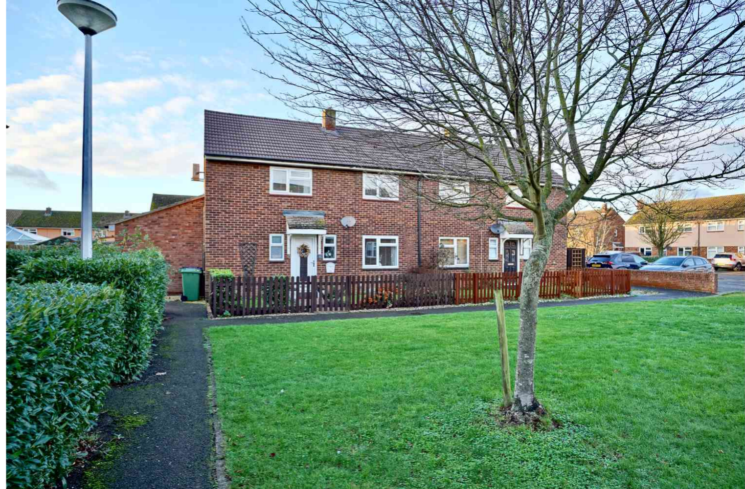
Belle Isle Crescent, Brampton PE28 4SJ