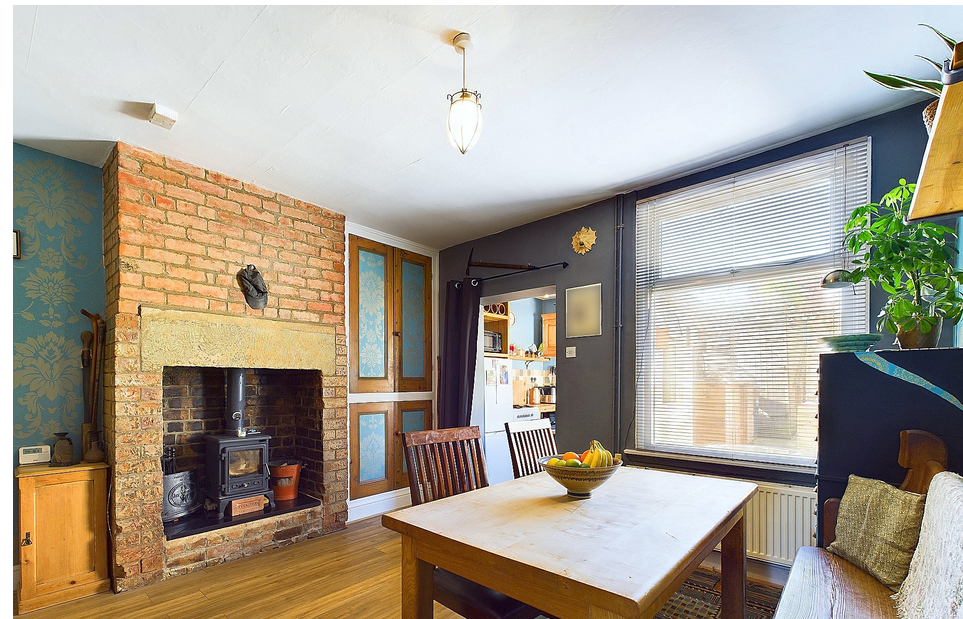
Belper Lane, Belper, Derbyshire DE56 2UJ £230,000 - Freehold