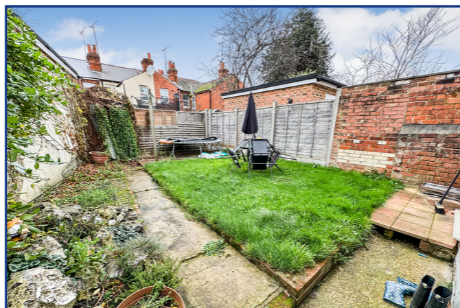
Pangbourne Street, Reading, Berkshire.