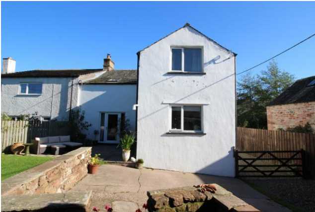
REAR OF THE PROPERTY

COUNCIL TAX BAND We are informed the property is Tax Band D. Eden District Council