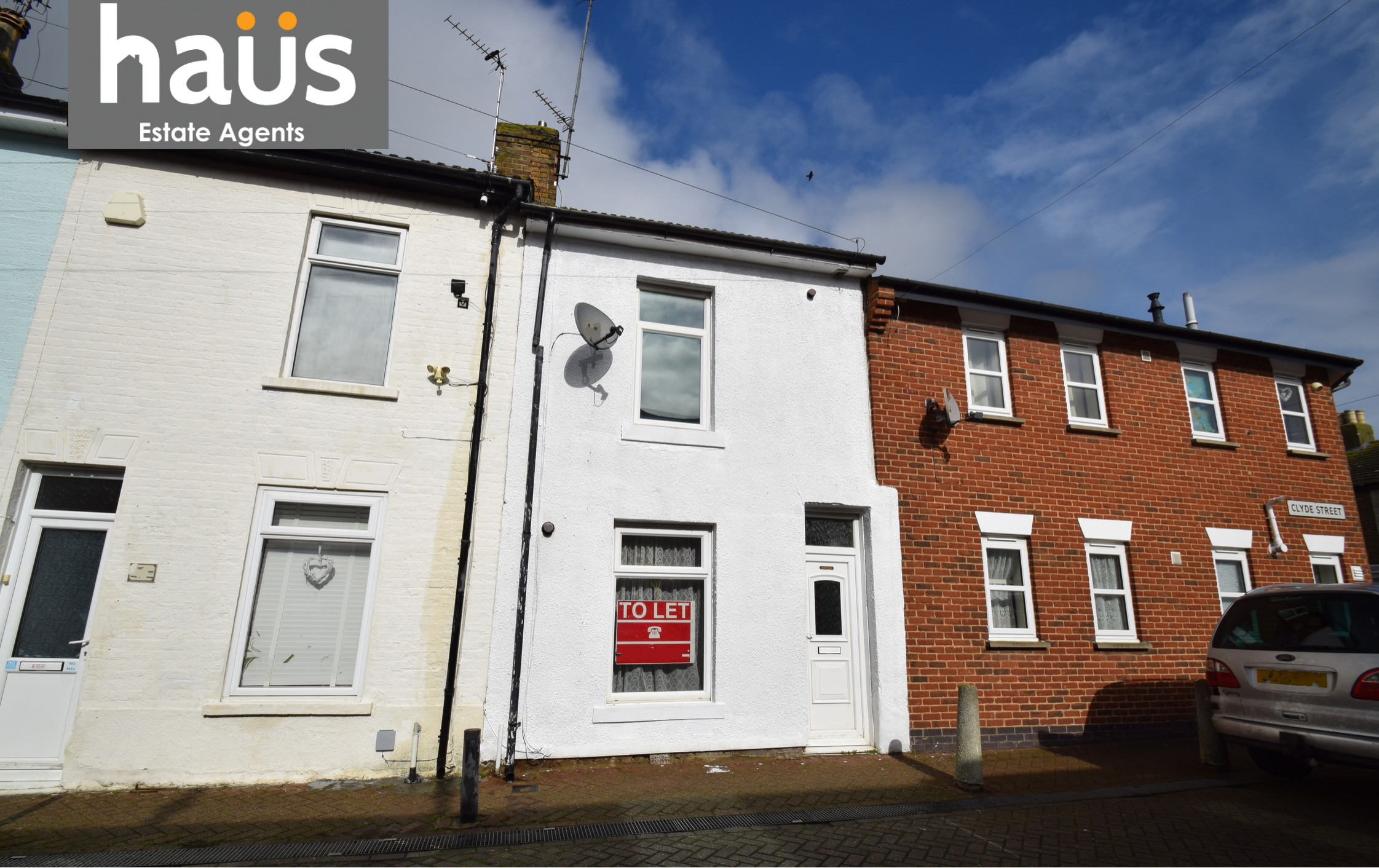
Three Bedroom Terraced House Clyde Street, Sheerness, Kent, ME12 2QG