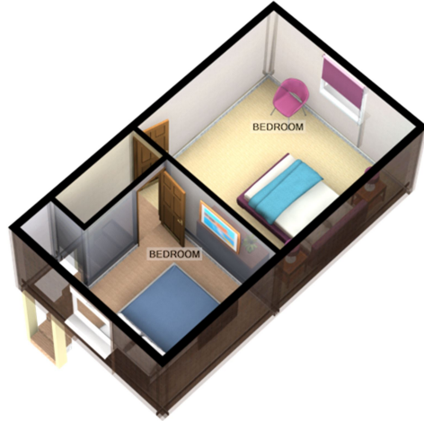
1ST FLOOR APPROX. FLOOR AREA 254 SQ.FT. (23.6 SQ.M.)