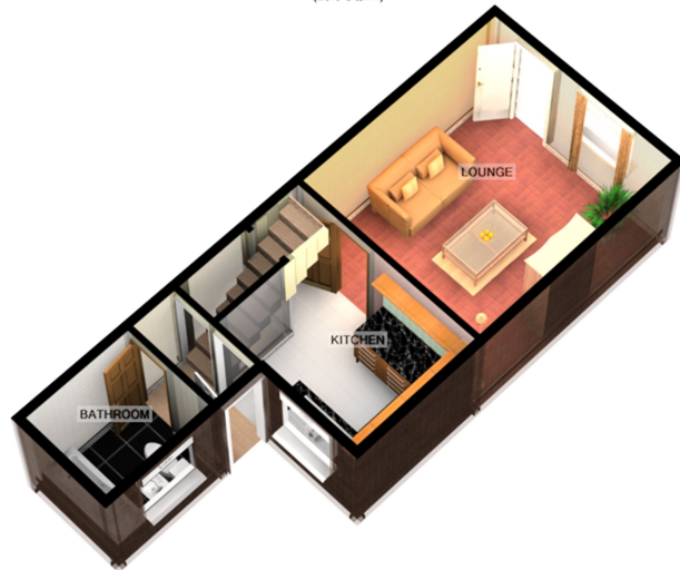
GROUND FLOOR APPROX. FLOOR AREA 309 SQ.FT. (28.7 SQ.M.)