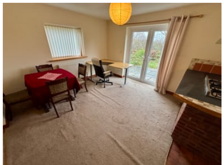
KITCHEN (FOURTH IMAGE)