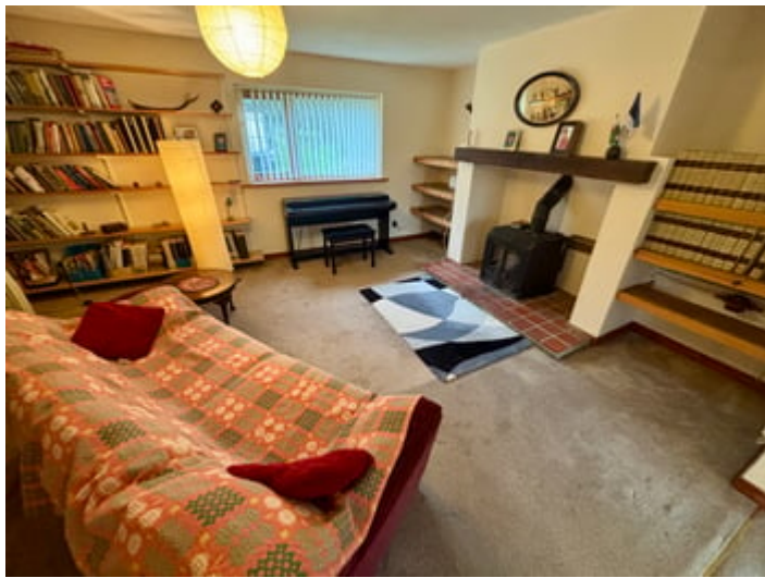
LIVING ROOM (SECOND IMAGE)