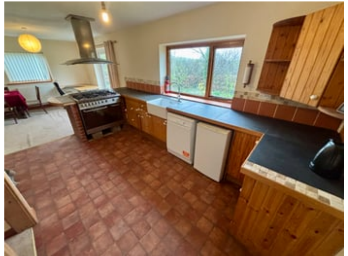
KITCHEN/DINER (THIRD IMAGE)