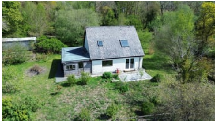
REAR OF PROPERTY (SECOND IMAGE)