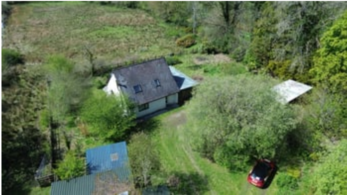
GARDEN (SECOND IMAGE)